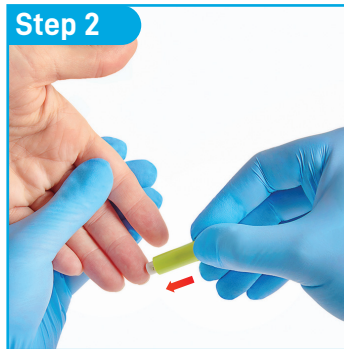
Step 2 Press against test site to activate the device