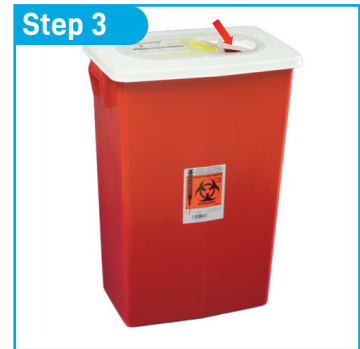
Step 3 Collect blood sample and Discard the device into sharps container

Test Sites Prick the side of the finger, not the pad